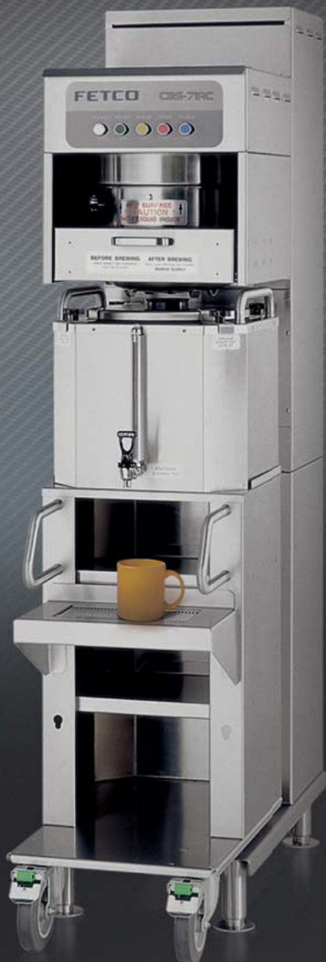
Shown with 6.0 Gallon Mobile LUXUS® Thermal Dispenser (LBD-6C) and Serving Station for LBD-6 with Drip Tray

FETCO® is the category expert and the ONLY manufacturer of ultra high-volume (7-24 Gallon) portable coffee brewing systems for very large scale operations. Due to the high capacity output and reliable performance the CBS-7000 Series is the preferred choice for specification in hotels, stadiums, convention centers and other large venues.