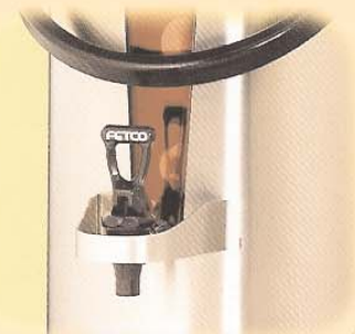
3 Removable Liner for Ease of Cleaning