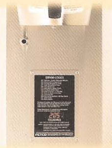
2 Effortless External Calibration of Recipe