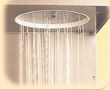
1 Intermittent Spray Feature