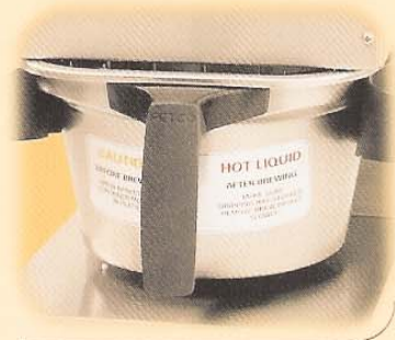
Grinding Straight Into Brew Basket