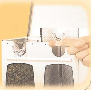
Easily Removable Hoppers