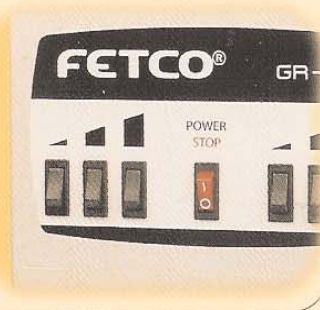
Portion Control Interface