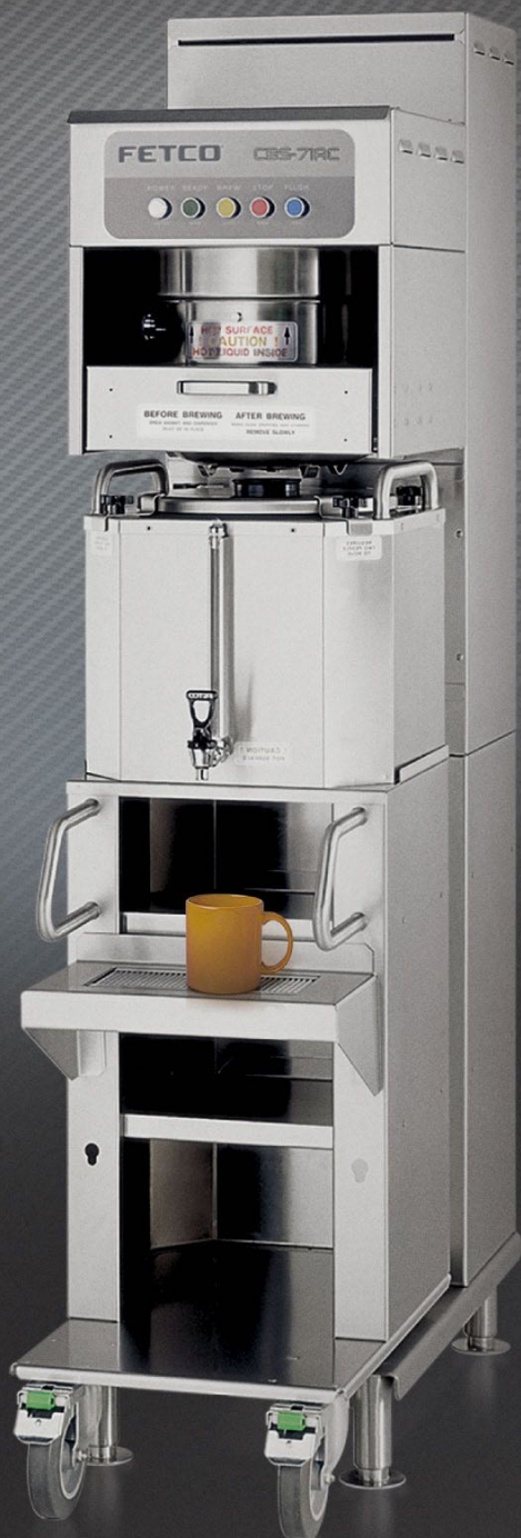
Shown with 6.0 Gallon Mobile LUXUS® Thermal Dispenser (LBD-6C) and Serving Station for LBD-6 with Drip Tray

FETCO® is the category expert and the ONLY manufacturer of ultra high-volume (7-24 Gallon) portable coffee brewing systems for very large scale operations. Due to the high capacity output and reliable performance the CBS-7000 Series is the preferred choice for specification in hotels, stadiums, convention centers and other large venues.